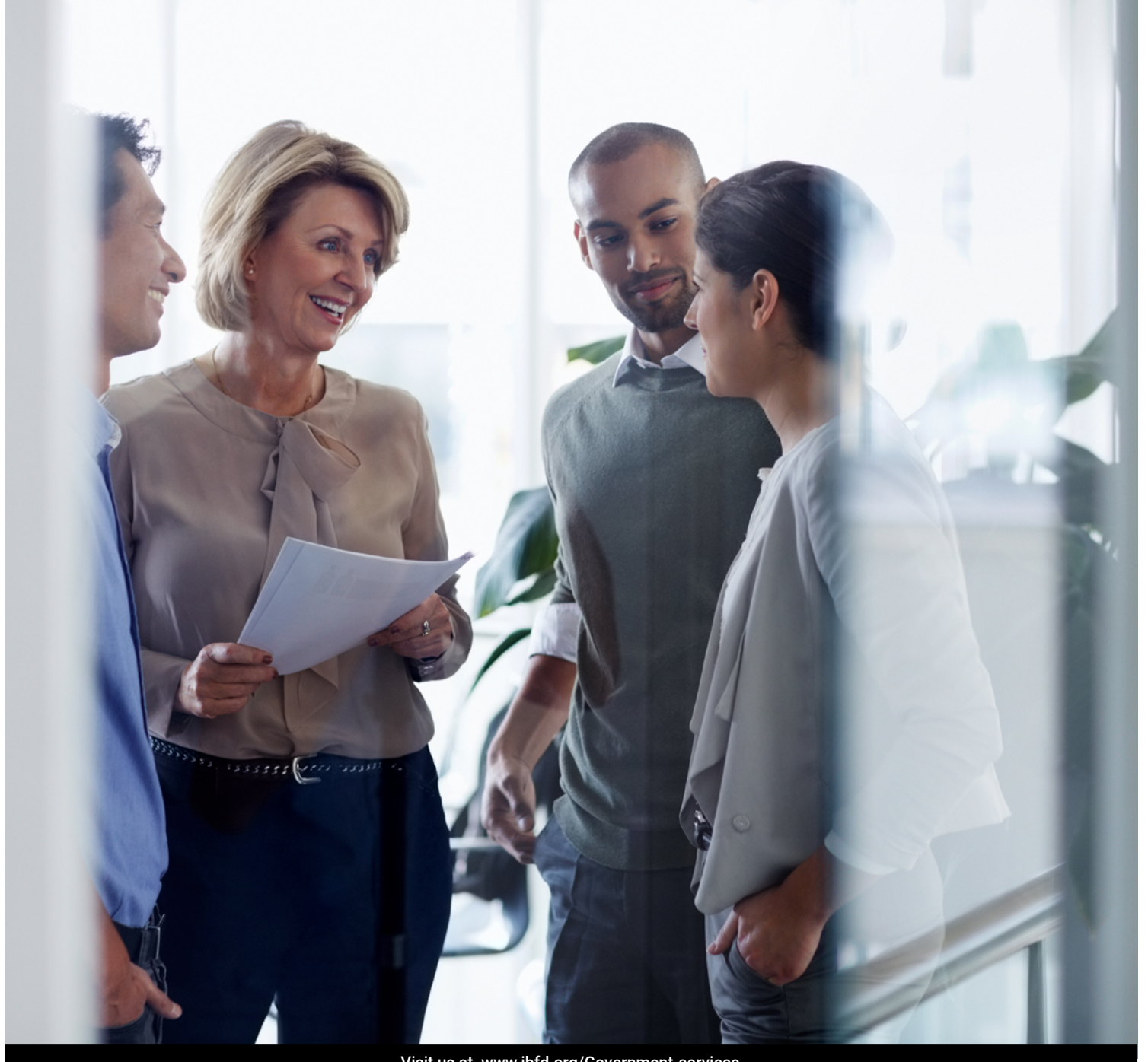
Visit us at www.ibfd.org/Government-services

Consulting, Training and Development for Governments and Revenue Authorities Worldwide